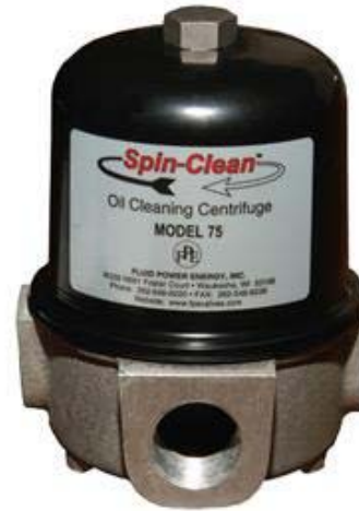
Model 75 & 75-1

The lube oil cleaning Centrifuge removes the solids from the engine oil using centrifugal force, a force of 1000 "G's", or 1000 times the force of gravity. These solids are stored inside of the rotating turbine bowl, which will hold more than 10 times the solids of your engines full-flow filters. The act of exposing the oil to 1000 "G's" is what results in micron removal less than one. Once the particles have been removed the clean oil is then returned to the oil pan.